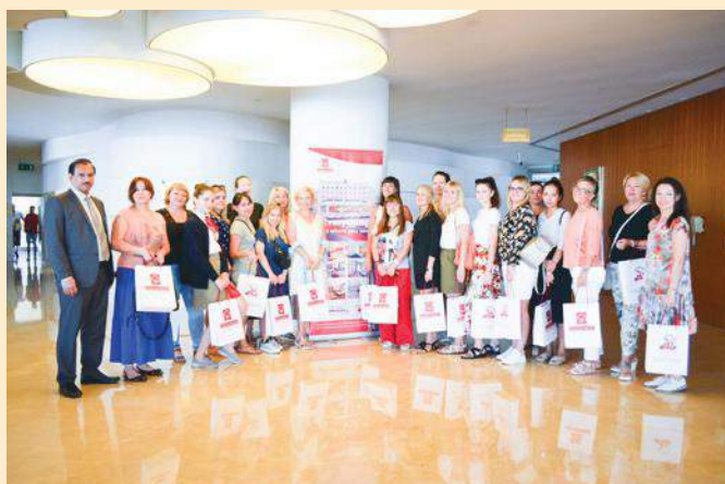
Fam Trip Anex Tour – Samara, Russia