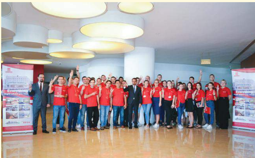
Anex Tour Training Programs held at Al Nahda Banquet Hall in preparation for the upcoming season