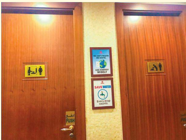
Posters on water & energy conservation are displayed in hotel’s lobby washrooms, staff cafeteria & accommodation, common areas

Green initiatives, upholding the authentic heritage of the region and knowledge in supply chain sustainability were discussed to better identify critical risks to improve long-term profitability.