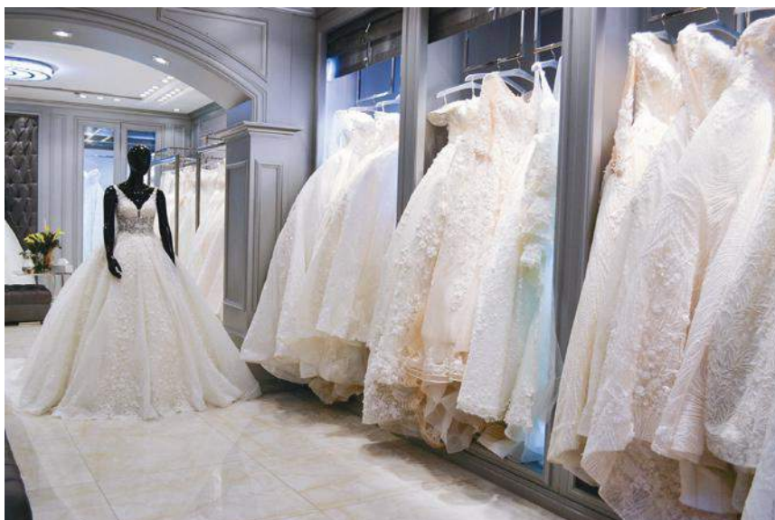
Check out the new bridal collection and designer gowns at Al Daker Shop