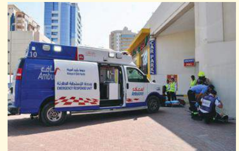
Crisis Management and Emergency Response Team on the move as they perform the drill