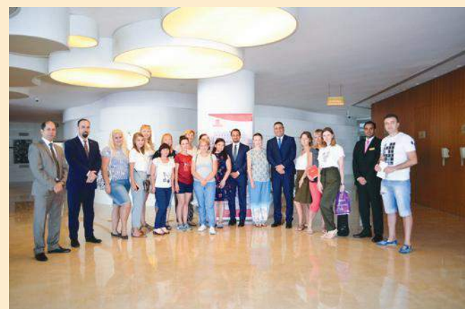
Fam Trip Anex Tour – Nizhny Novgorod, Russia