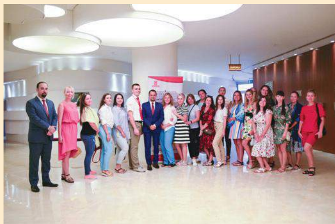
Fam Trip Anex Tour – Novosibirsk, Russia