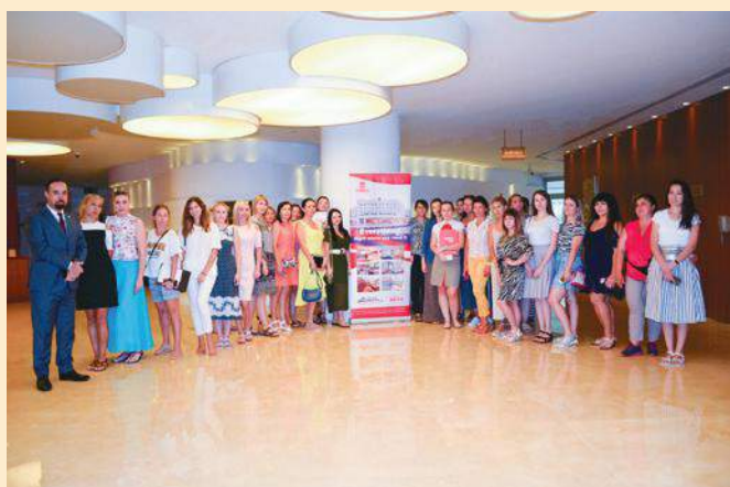
Fam Trip Anex Tour – Irkutsk, Russia