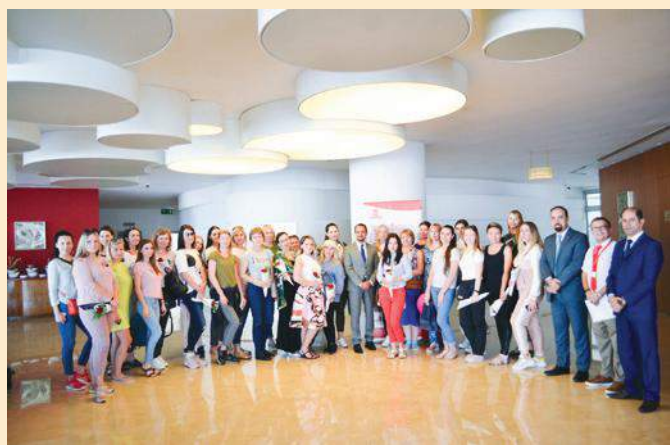
Fam Trip Anex Tour – Krasnoyarsk, Russia