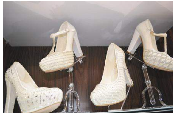
Try on the new collection of dazzling shoes only at Smile View