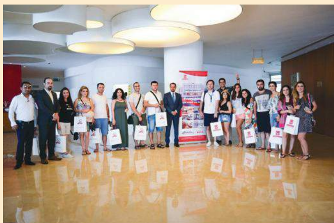
Fam Trip Pegas Touristik – Baku, Azerbaijanian