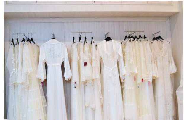
Variety of selections and styles available at 2nd Skin